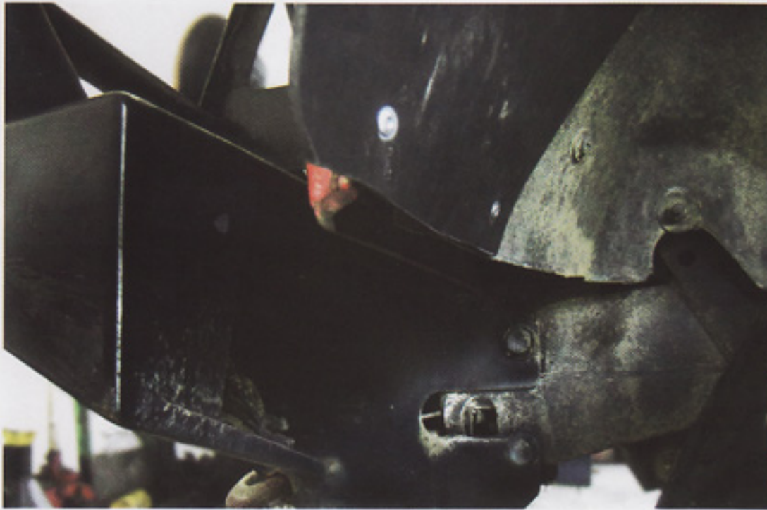
Note the mounting of the bull bar onto the chassis.