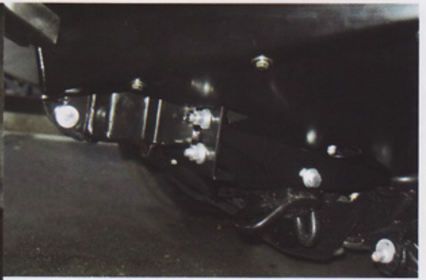
ARB bull bar with an air bag compatible device.